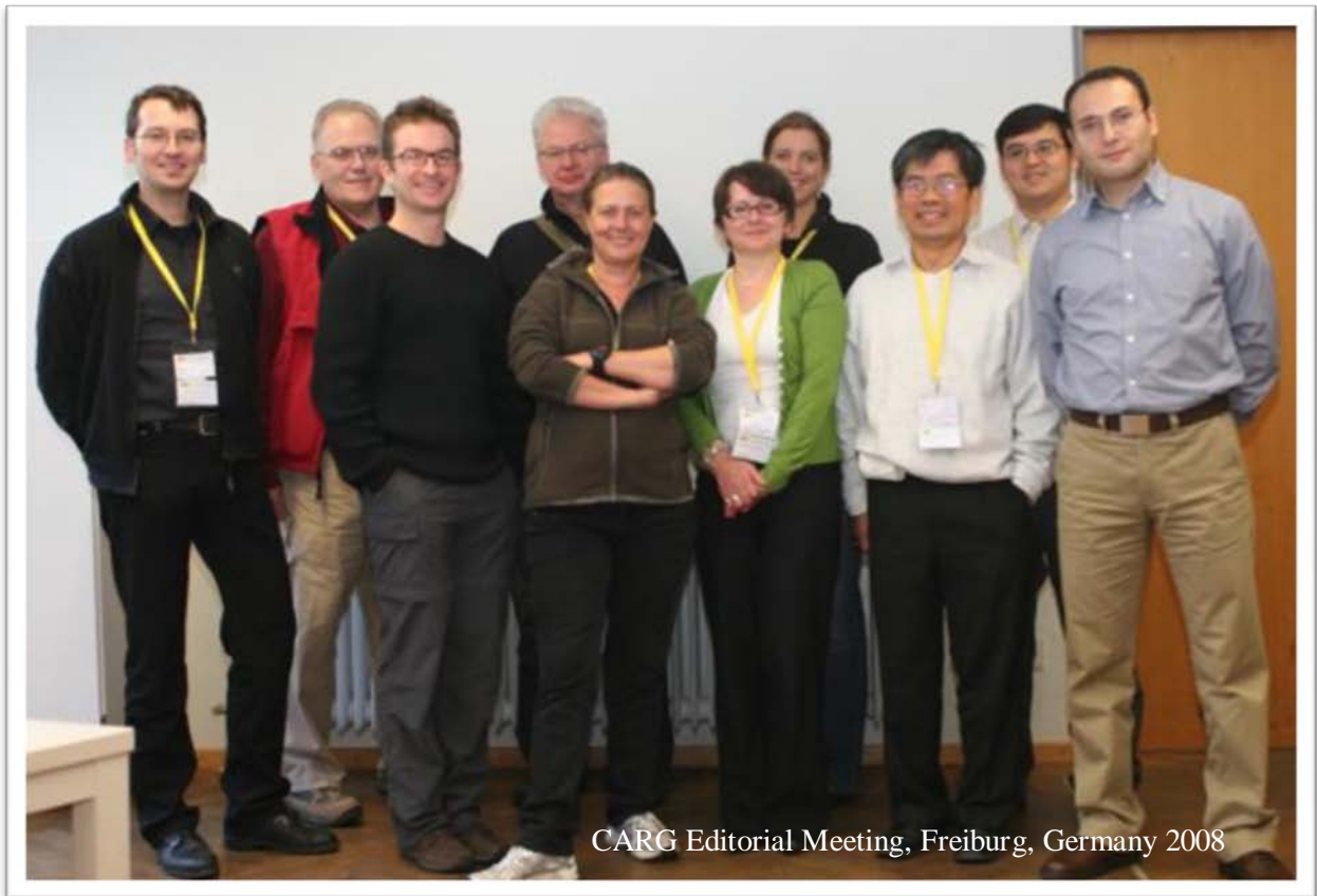
CARG Editorial Meeting, Freiburg, Germany 2008