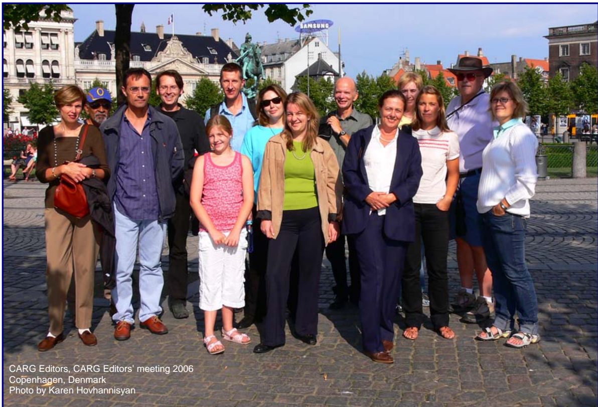
CARG Editors, CARG Editors' meeting 2006 Copenhagen, Denmark